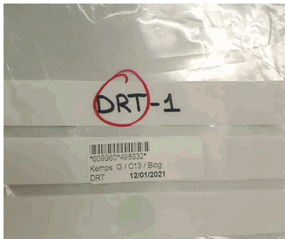
Package received - labeling COC

Laboratory Number Beta-609960 Percent modern carbon (pMC) 98.84 +/- 0.27 pMC Atmospheric adjustment factor (REF) 100.0; = pMC/1.000