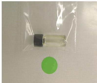
View of content (1mm x 1mm scale)